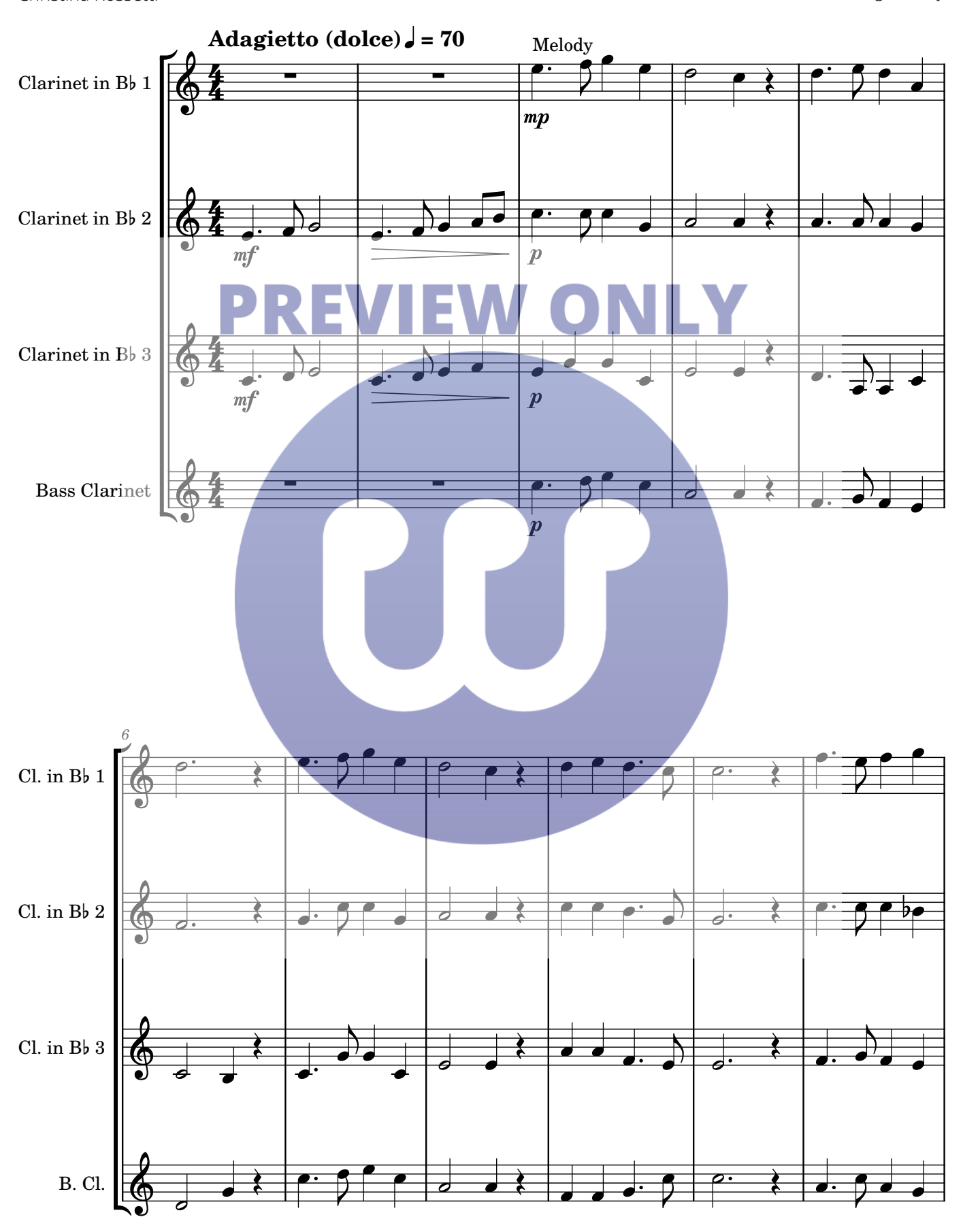
© Copyright arrangement, 2023, Hugh Levey, woodwindly.com. All rights reserved. Do not copy or reproduce this music without the express permission of the copyright holder.