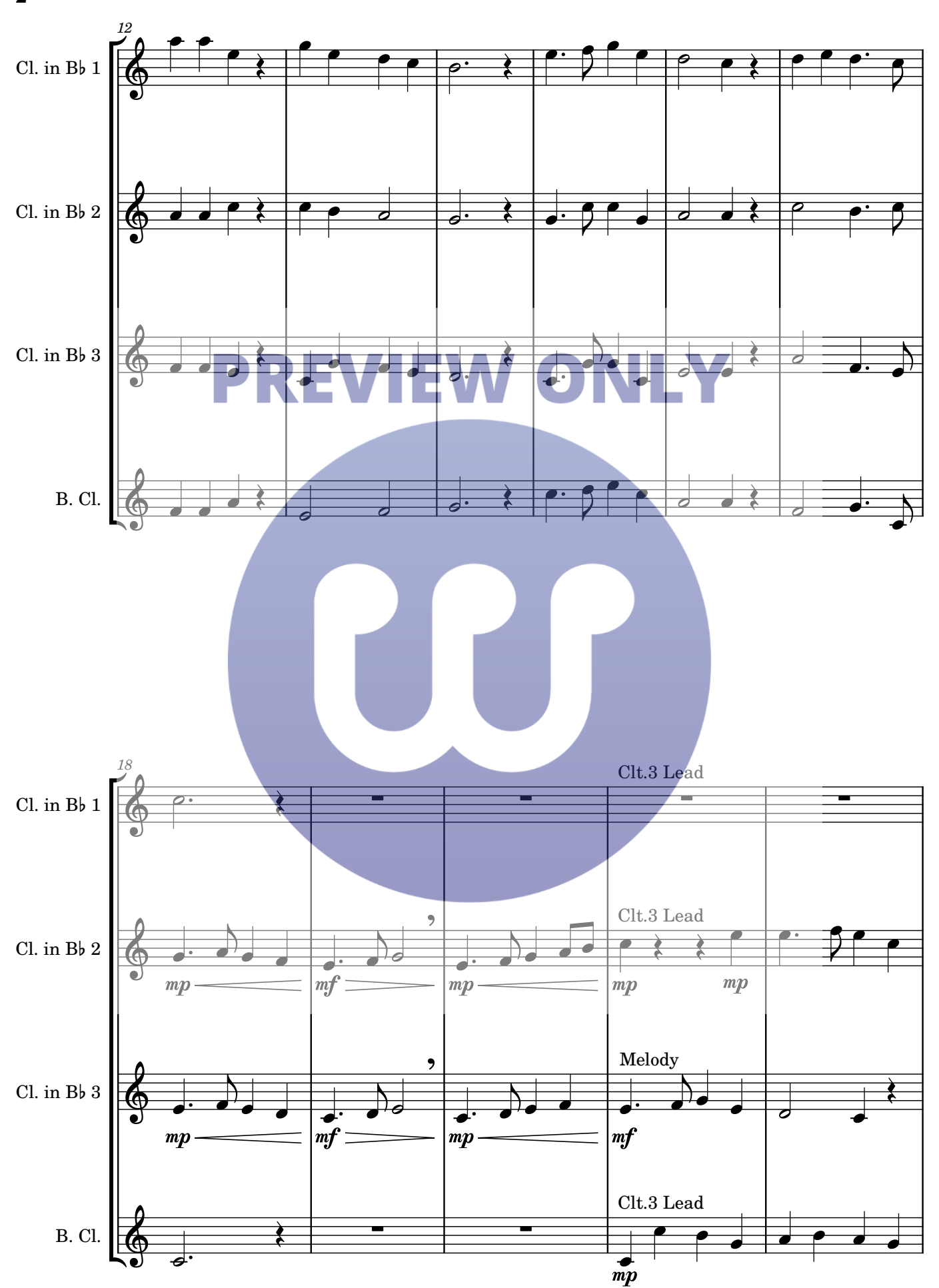
© Copyright arrangement, 2023, Hugh Levey, woodwindly.com. All rights reserved. Do not copy or reproduce this music without the express permission of the copyright holder.