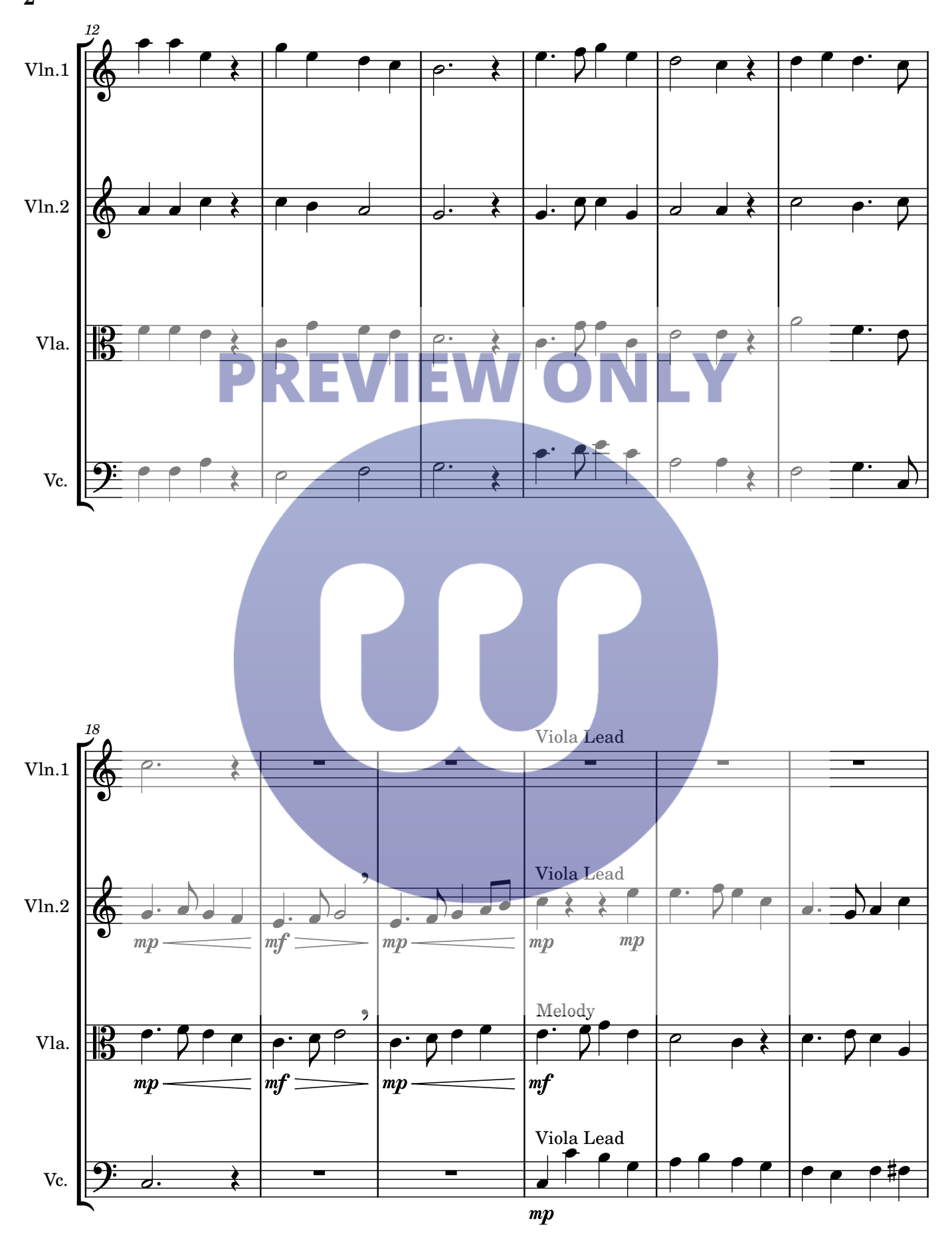
© Copyright arrangement, 2023, Hugh Levey, woodwindly.com. All rights reserved. Do not copy or reproduce this music without the express permission of the copyright holder.