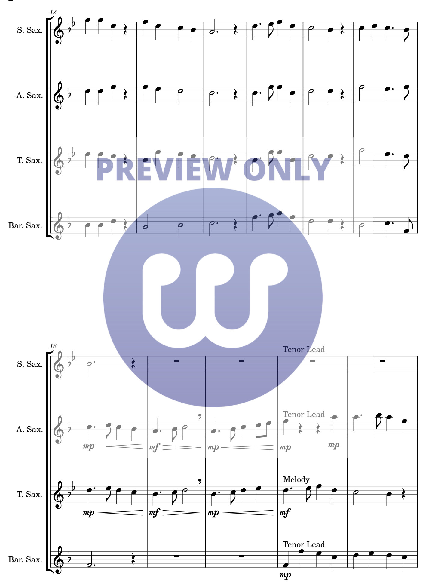
© Copyright arrangement, 2023, Hugh Levey, woodwindly.com. All rights reserved. Do not copy or reproduce this music without the express permission of the copyright holder.