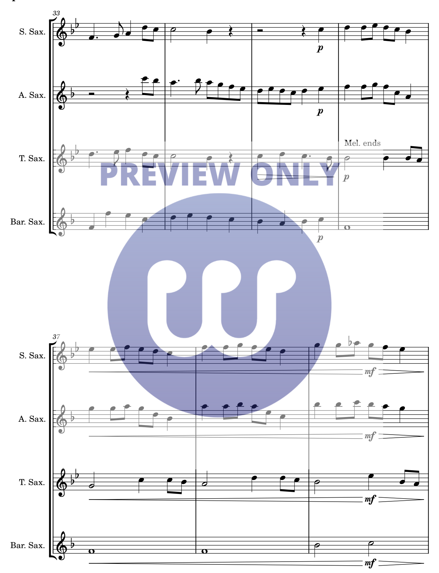
© Copyright arrangement, 2023, Hugh Levey, woodwindly.com. All rights reserved. Do not copy or reproduce this music without the express permission of the copyright holder.