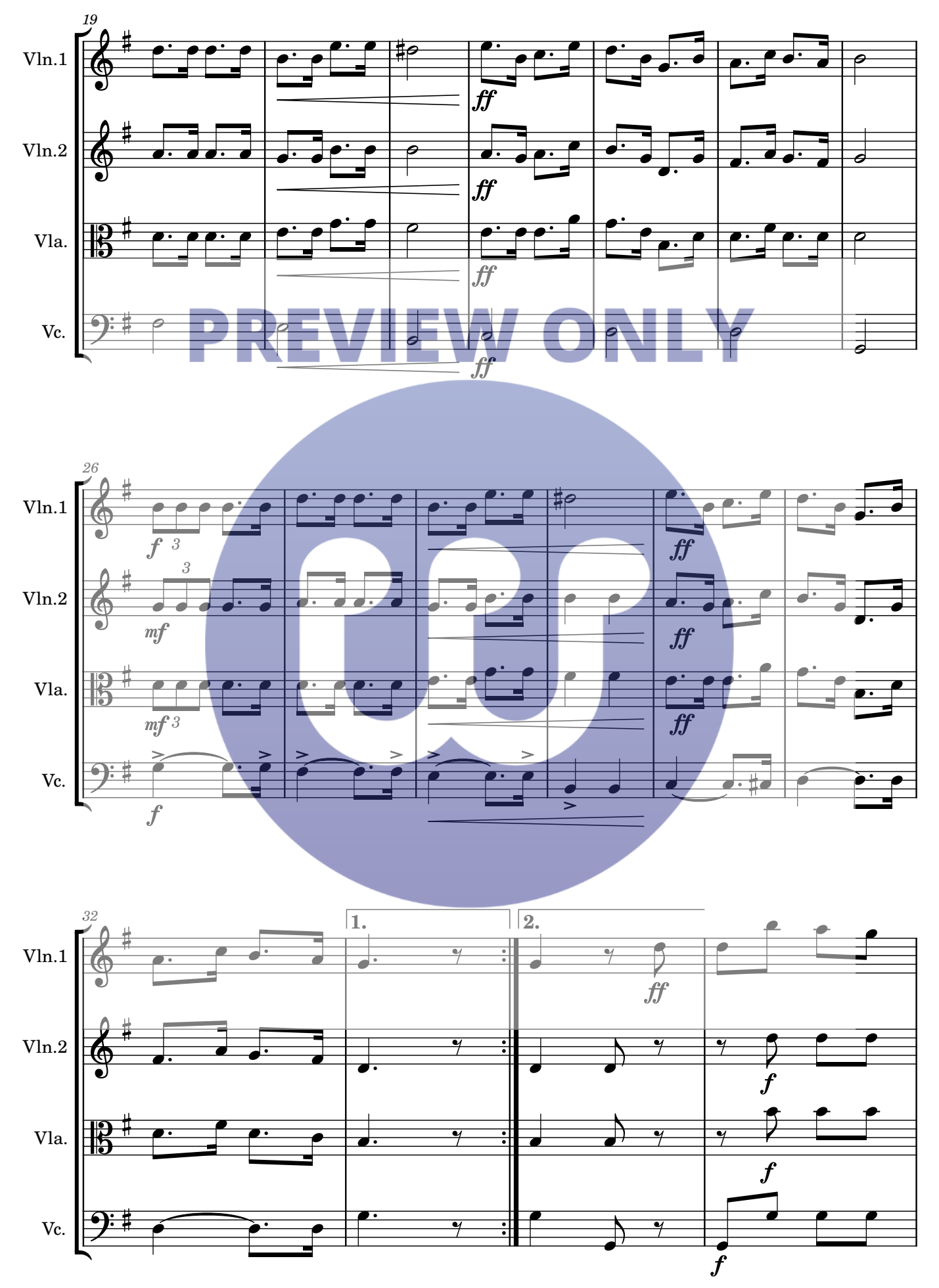
© Copyright arrangement, 2023, Hugh Levey, woodwindly.com. All rights reserved.