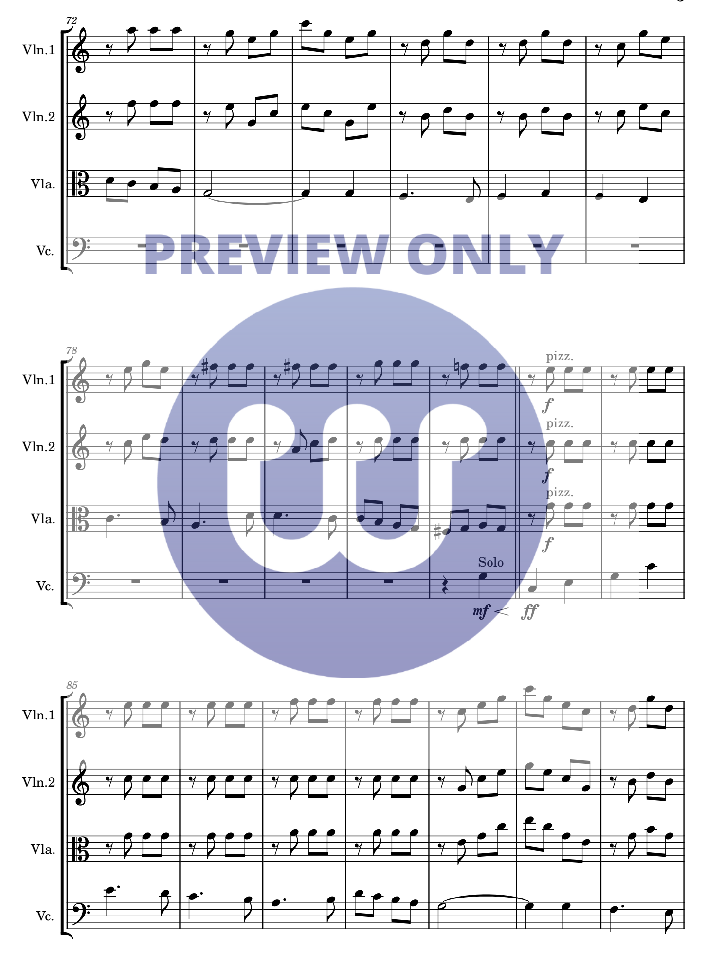
© Copyright arrangement, 2023, Hugh Levey, woodwindly.com. All rights reserved.