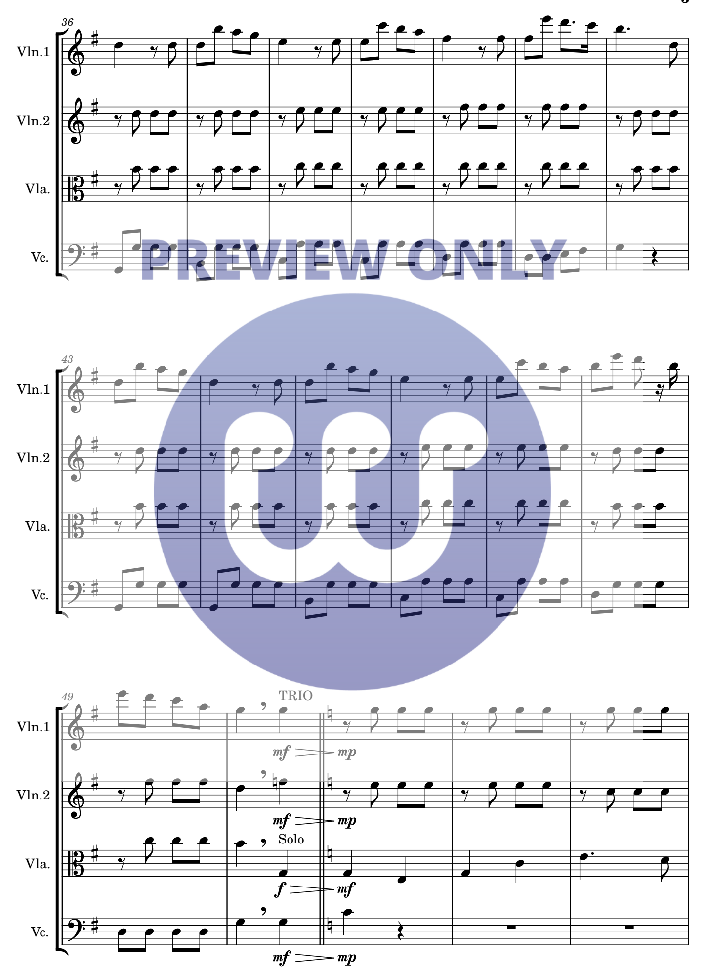
© Copyright arrangement, 2023, Hugh Levey, woodwindly.com. All rights reserved.