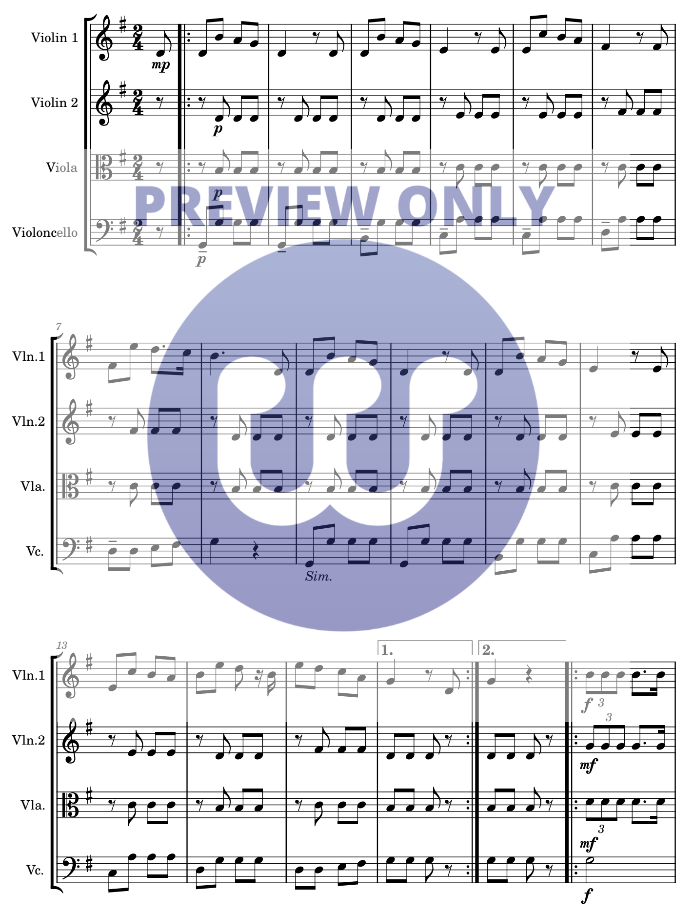
© Copyright arrangement, 2023, Hugh Levey, woodwindly.com. All rights reserved.