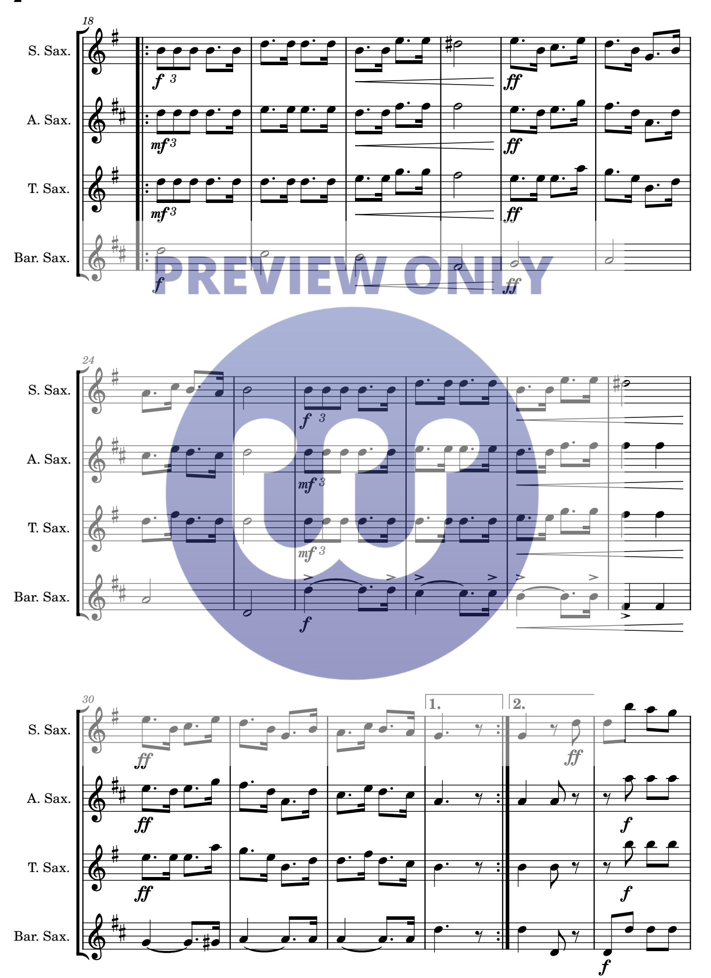
© Copyright arrangement, 2023, Hugh Levey, woodwindly.com. All rights reserved.