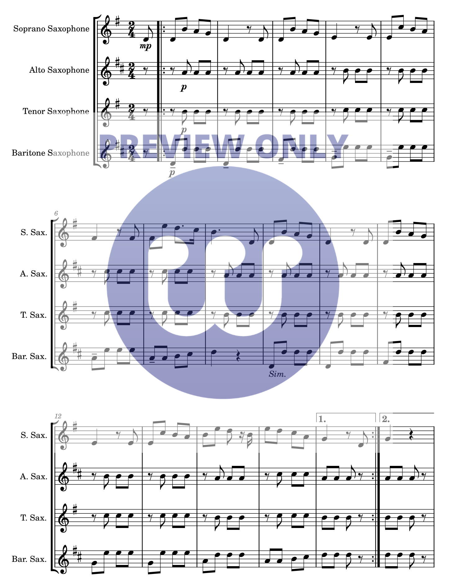
© Copyright arrangement, 2023, Hugh Levey, woodwindly.com. All rights reserved.