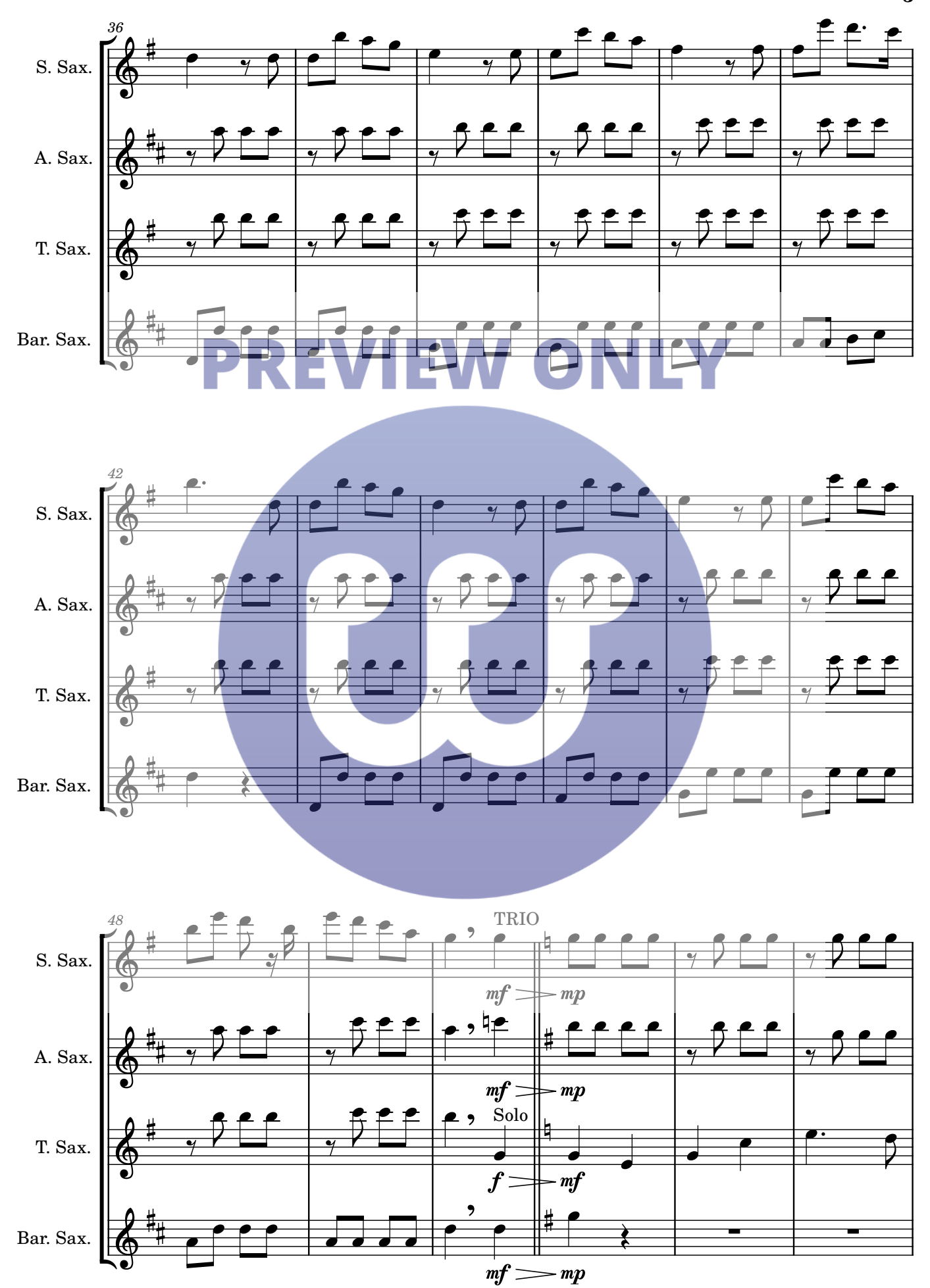
© Copyright arrangement, 2023, Hugh Levey, woodwindly.com. All rights reserved.